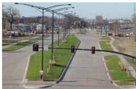
Looking west on MLK Parkway at SE 9th Street

The new bridge is higher than other downtown river crossings and should be