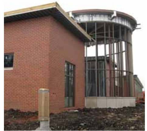
Story Time Room Addition at Franklin Avenue Library.