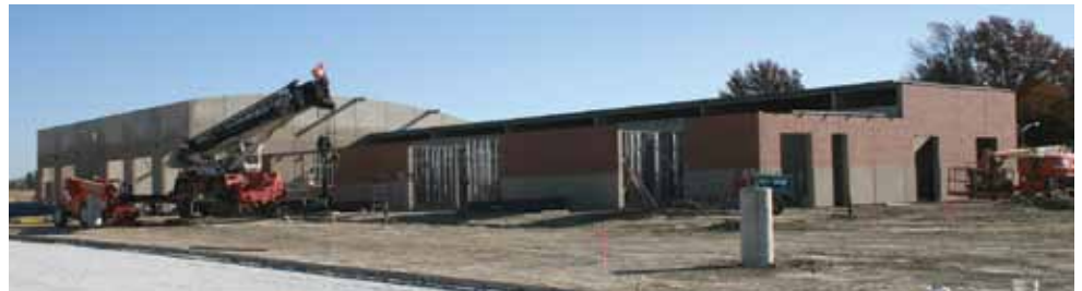
The $5.8 million car rental facility at DSM International Airport is expected to be completed May 2011.