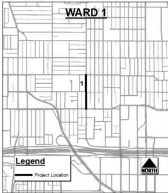
1. 13th St - Forest Ave to University Ave