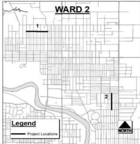
1. Madison Ave - 6th St to 11th St 2. E 13th St - Arthur Ave to Thompson Ave