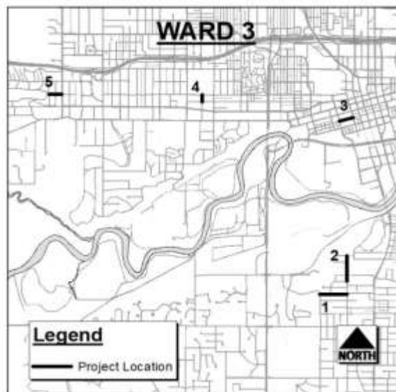
1. Creston Ave - SW 14th St to SW 12th St 2. SW 12th St - Davis Ave to Edgemont St 3. Walnut St - 10th St to 12th St 4. 29th St - High St to Woodland Ave 5. Woodland Ave - 49th St to Polk Blvd