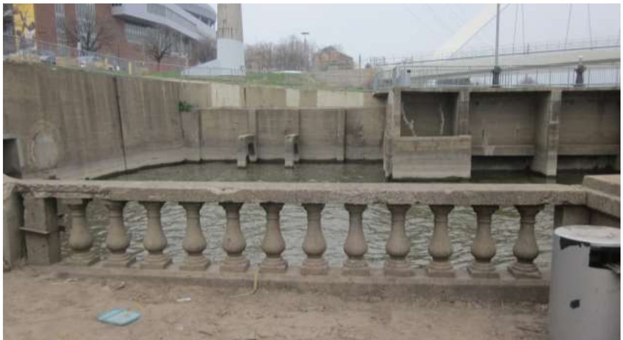
EXAMPLES OF EXISTING CONDITIONS