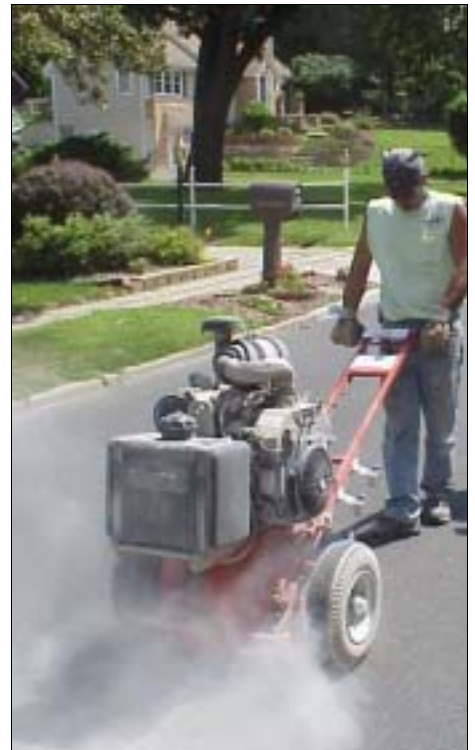
Joe Ernst prepares cracks in street for sealing operation

This maintenance procedure will ensure that the many new pavement resurfacing projects being constructed with gaming revenues will provide the full service life that they have been designed for.