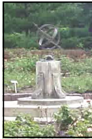
Greenwood Park Rose Garden Sundial